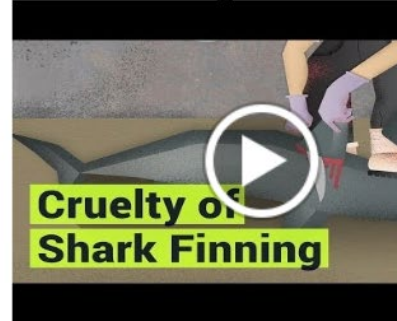
3. Human impacts on habitat