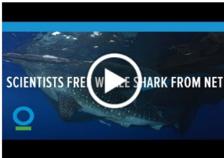
1. Fishing: Longlining and nets

People are fearful of sharks, but the reality is humans are a bigger threat to sharks than they are to us. About 100 million sharks are killed by people every year. Sharks die at the hands of humans. Click each link to learn why humans are a threat to sharks.