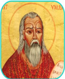
History of Valentine's Day