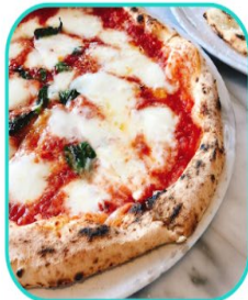
Let's Go To Rome!