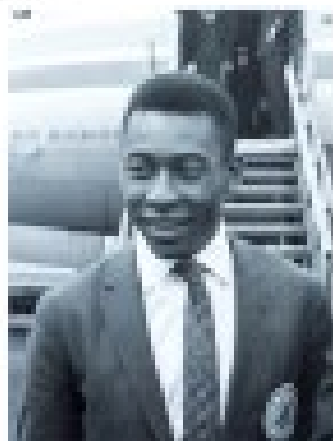
Pelé in 1962.

Pelé continued to win. He played for two more winning World Cup teams in 1962 and 1970. In 1970, he scored the 100th goal of his career. He was the biggest goal-scorer in the history of soccer. Pelé retired in 1974. In 1975, he came out of retirement to join the New York Cosmos. The Cosmos are a U.S. soccer team. He led them to a championship