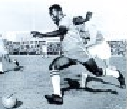
Pelé playing for Brazil, May 1960.

in 1977. He stopped He stopped playing soccer, but he is a legend. He became an ambassador for soccer. He worked to promote peace through sports. Pelé was named FIFA's "Co-Player of the Century." In all, he scored 1,260 goals in 1,163 games of his career. All soccer players admire Pelé's legacy.